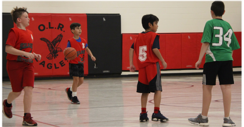
Junior Boys Basketball