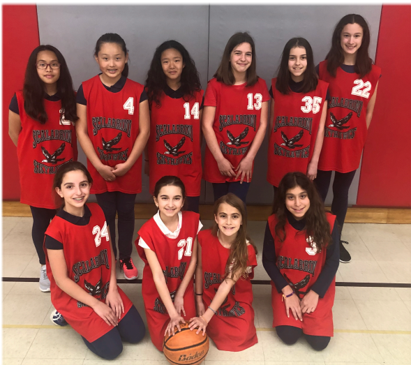
Junior Girls Basketball Team