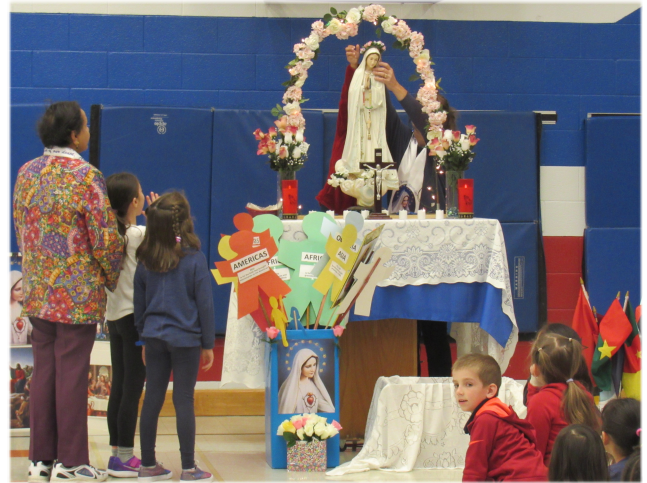
Rosary Apostolate - Marian Celebration